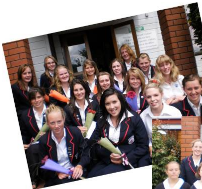
Above: Our fabulous Year 13s following the Leaders Induction last Friday